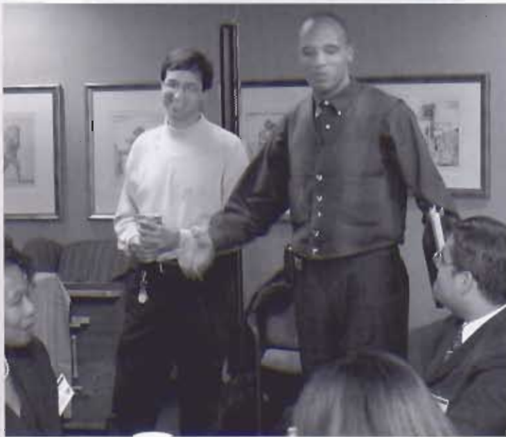
RIT's Future Faculty Career Exploration Program

cuses that there aren't enough qualified minority students and faculty available. In 2002-3, RIT developed a specialized recruitment program to focus on diversity. That year, 31% of all faculty hires were from the three underrepresented minority groups where they placed the strongest focus (African American, Latin American, and Native American). In 2003-4, 30% were from these groups. The new hires nearly doubled minority faculty on campus. This is an amazing feat, especially when you note that nationally, only about 6 percent of faculty in science and technology disciplines are from these minority groups. Increasing the number of minority faculty is critical, because they serve as role models for the students and better represent the multicultural world that exists today.