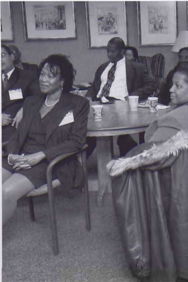
RIT's Future Faculty Career Exploration Program

Presently the program has resulted in two of the thirteen prospects who participated in the 2003 program receiving offer of employment. Both offers were in RIT's Kate Gleason College of Engineering in electrical engineering and industrial engineering, respectively. ■